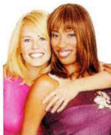
MISS MISBEHAVING In 2002, Handler first shocked viewers as a prankster on Oxygen's Girls Behaving Badly .