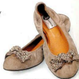
Ballerina flats, Lanvin, $773; 646-439-0380.