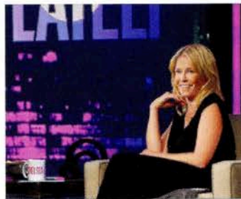
WEST COAST HOST On her late-night talk show— Chelsea Lately , on E!—the brazen blonde skewers pop culture's icons and casualties and revels in making her guests blush.