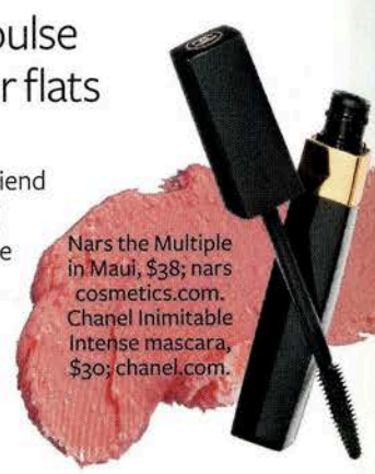
Nars the Multiple in Maui, $38; narscosmetics.com. Chanel Inimitable Intense mascara, $30; chanel.com.