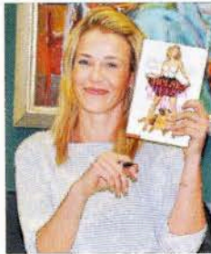
LIT WIT Already a best-selling author, she bares all again in her latest book, Chelsea Chelsea Bang Bang .